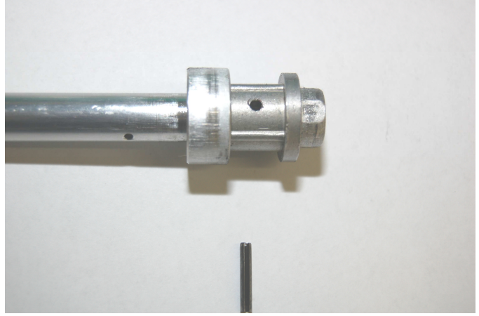
Remove roll pin & cut down so as not to block oil flow thru center of damping rod