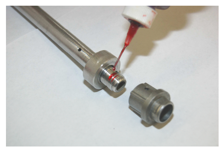
Loctite & reinstall damping rod head, re-install cut down roll pin portions to secure.